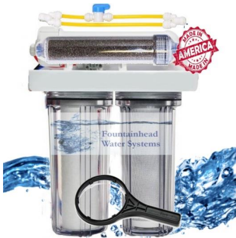
4 STAGE RO DI SYSTEM